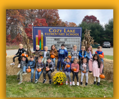
COZY LAKE'S PUMPKIN PATCH

Cozy Lake held their second annual Pumpkin Patch Day. Students were able to pick a pumpkin from the school's patch which they painted and displayed at the Halloween parade.